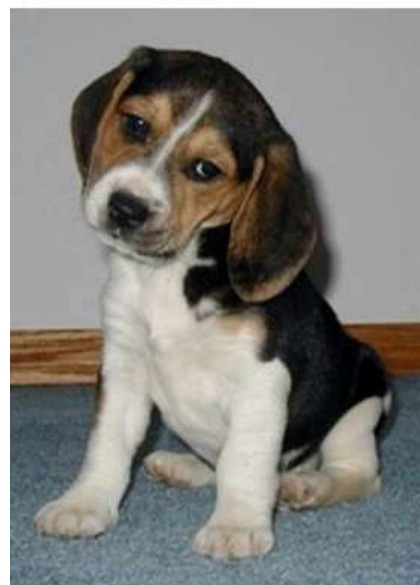
Then Adopt a Dog!

If you want someone who will never touch the remote, doesn't care about football, and can sit next to you as you watch romantic movies