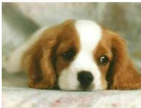
Then Adopt a Dog

If you want someone who is content to get on your bed just to warm your feet and whom you can push out of bed if he snores